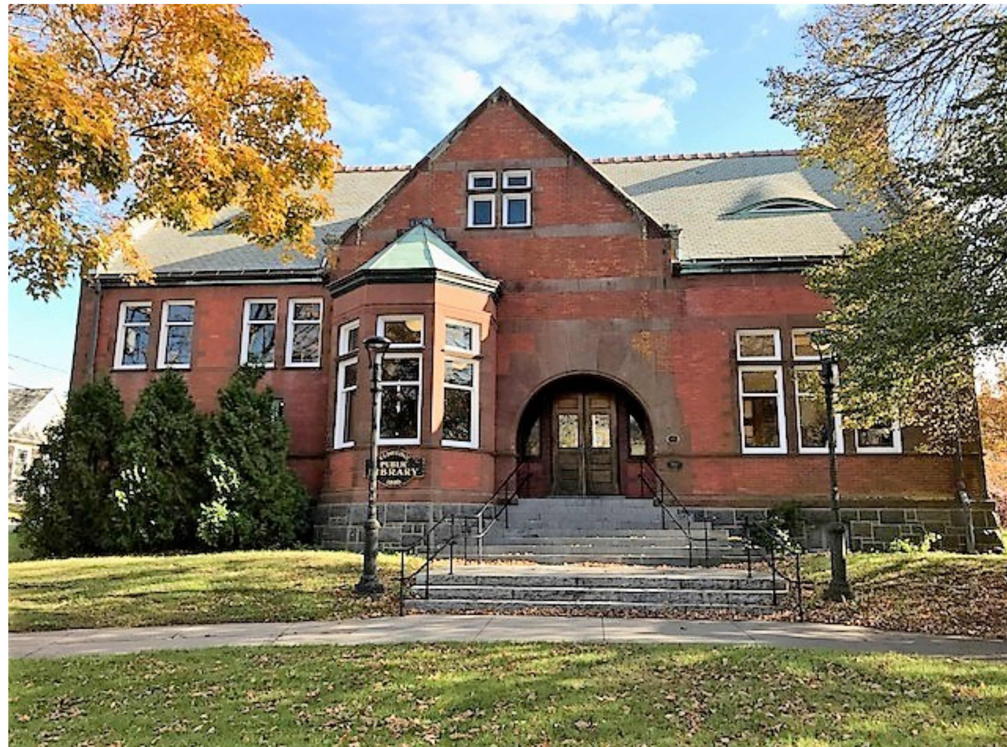
564 Main Street - Eldredge Public Library Owner: Town of Chatham